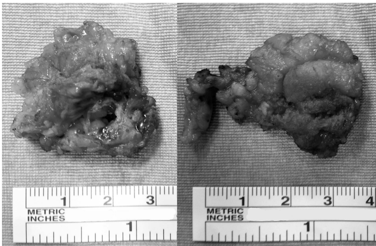
Figure 2. Removed endometriotic nodule.

implants found in other areas of the body, including the gastrointestinal tract, pulmonary structures, urinary system, abdominal wall, skin, and even the central nervous system.