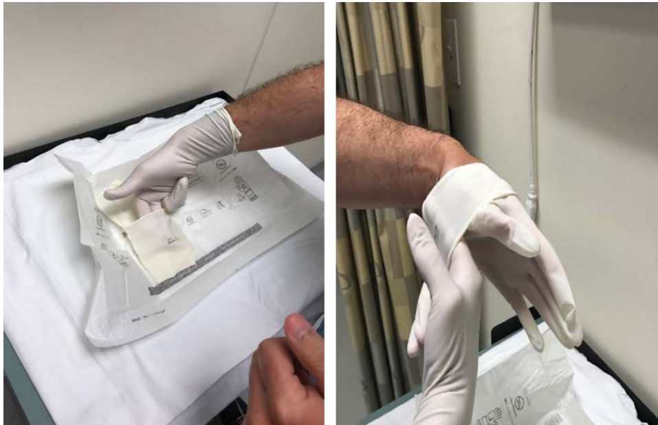
Step 9. Prepare to glove the remaining hand. After properly gloving the first hand, use the second and third digits (or the second through fifth digits) of the already gloved hand (left image) to lift the glove and facilitate placement of the ungloved hand into the remaining glove (right image).