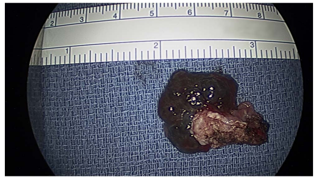
Figure 3. Gross evaluation of the right tonsil revealed a 3-cm exophytic pigmented lesion that had replaced grossly normal tonsil lymphoid tissue.

to the SEER database, the incidence of melanoma in African Americans is 1.2 per 100,000 males and 1.0 per 100,000 females compared to 33.0 per 100,000 Caucasian males and 20.2 per 100,000 Caucasian females. 2 Although melanoma is more common in Caucasians, African Americans frequently present with more advanced disease, thicker melanomas, and lower disease-specific survival than Caucasians. 7 African Americans more commonly present with melanoma on the acral surfaces (palms, soles, and nail beds) compared to Caucasians. 7 African Americans more commonly present with the more aggressive acral lentiginous subtype compared to the superficial spreading subtype found more frequently in Caucasians. Overall, the majority of melanomas are cutaneous, and <10% are of mucosal origin of the aerodigestive tract. 8 Because of the indolent and painless nature of the primary melanoma tumor, many patients present with distant metastasis involving common metastatic sites such as lymph nodes, lung, brain, and liver. The median survival at this stage is 6-9 months, and the 5-year survival rate is <5%. 9 According to a retrospective review conducted at MD Anderson, only 0.6% of metastatic melanoma seeded the upper aerodigestive tract, of which 62% were systemically disseminated at presentation. 10 Interestingly, even with the proximity to the palatine tonsils of the oral mucosa, only one reported case had the primary melanoma tumor in this region. 11