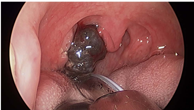
Figure 2. Intraoperative photograph demonstrates the large pigmented exophytic lesion of the right tonsil.

Melanoma is a relatively common cancer, ranking fifth in cancer incidence in males and sixth in females. According