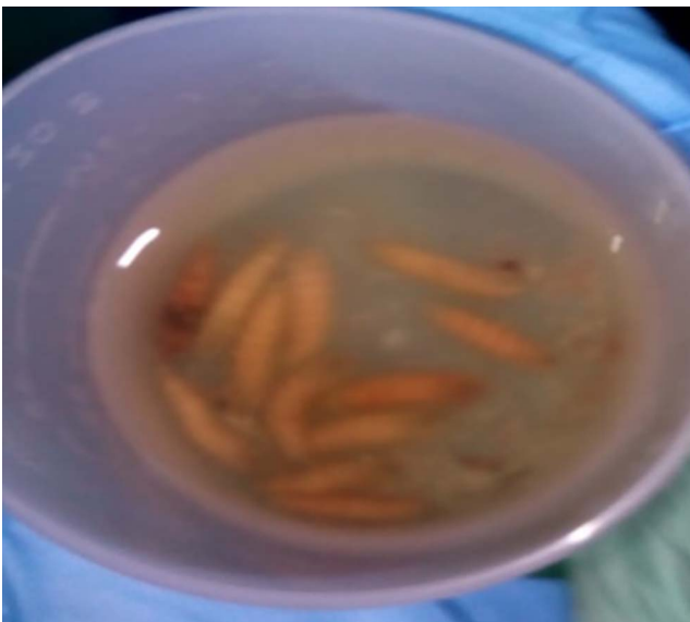
Figure 2. Twelve larvae were extracted from the patient's wound.

Wound myiasis is commonly caused by C hominivorax in South and Central America, including Haiti. 1,5 C hominivorax , also known as the New World screwworm (NWS), is an obligatory wound parasite that lays eggs in or on the edges of wounds. The female deposits multiple eggs at once. 1,2 After a short incubation period of nearly 24 hours, the eggs hatch and feed upon live tissue for 4 to 8 days. 1 During the maturation process, the larvae burrow or screw