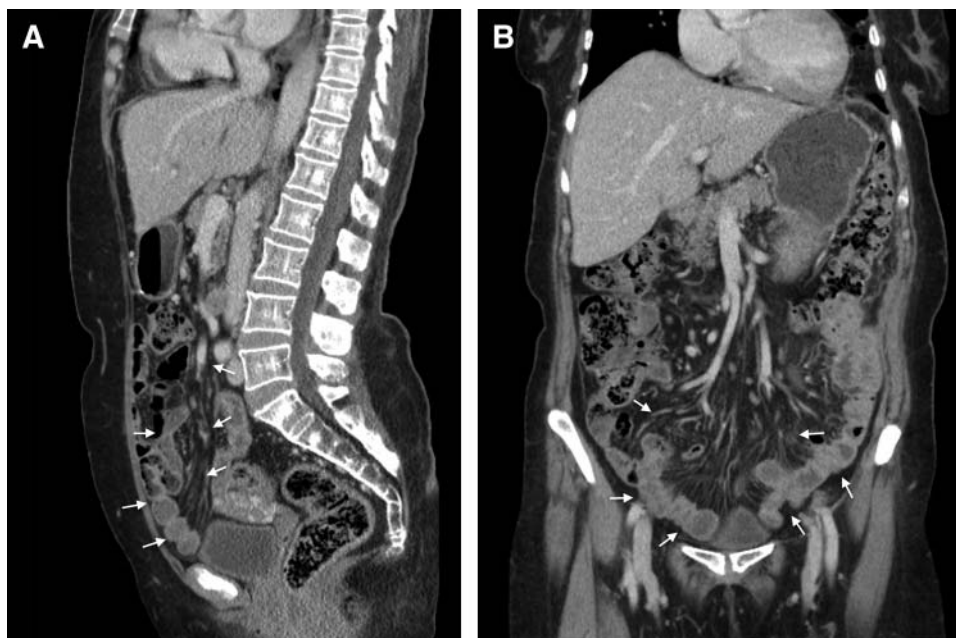
Figure 3. Sagittal (A) and coronal (B) views of an abdominal and pelvis computed tomography scan show thickening of the abdominal organs, specifically of the greater omentum (arrows). Surgical resection of the greater omentum revealed chronic granulomatous inflammation, confirming the diagnosis of gastrointestinal sarcoidosis.

organs. The patient recovered from surgery with no complications.