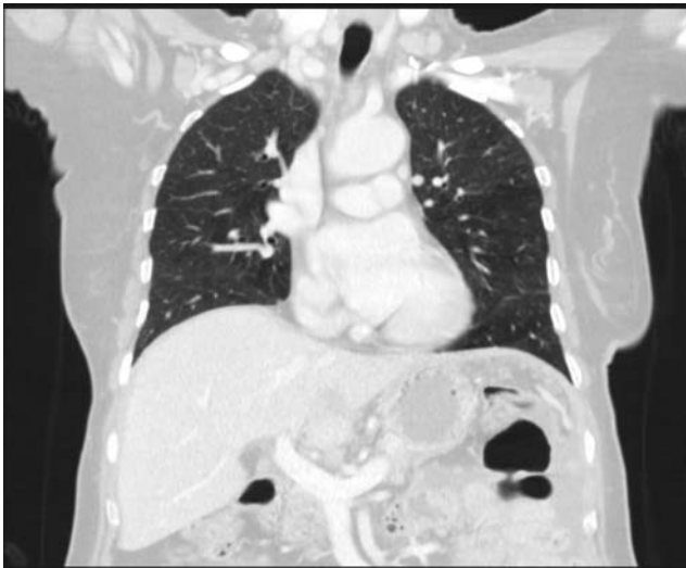
Figure 1. Coronal contrast-enhanced chest computed tomography scan shows no mediastinal lymph nodes, no evidence of metastatic disease, and no significant pulmonary finding except mild basal bronchial thickening.

took laxatives and acetaminophen to alleviate her constipation and abdominal pain; she took no other medications. Her appetite decreased, and she lost approximately 44 pounds in 3 months. She had no history of abdominal surgery except cesarean section more than 20 years prior. She had no known allergies, and her occupational and family histories were noncontributory.