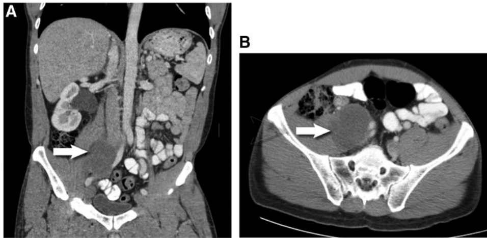
Figure 1. Computed tomography of abdomen and pelvis with intravenous contrast from initial hospital admission in (A) coronal view and (B) axial view shows a 6.5 × 5.3 × 6.8-cm right psoas hypoattenuating mass (arrow) compressing the right ureter with proximal ureteral and right kidney collection system dilatation. Medial deviation of the right iliac arterial vasculature and compression of the right venous iliac vasculature were present.

substances and intravenous (IV) drug use, and he had no history of human immunodeficiency virus (HIV).