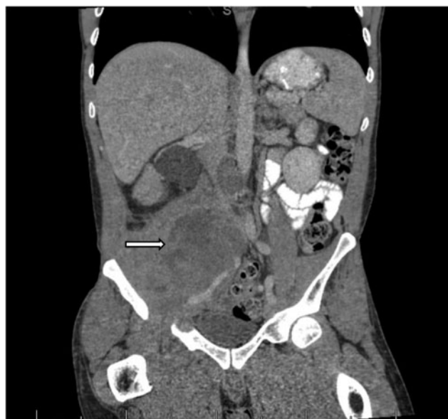
Figure 4. Computed tomography of abdomen and pelvis (coronal view) with intravenous contrast obtained after repeat pathology suggesting germ cell tumor and closest to chemotherapy initiation shows interval-enlarged hypoattenuating mass measuring 8.9 \times 12.7 \times 10.0 cm (arrow).

hydronephrosis and proximal hydroureter. Cardiovascular surgery noted no emergent vascular compromise on clinical examination and imaging. CT of the chest and magnetic resonance imaging of the brain as part of the malignancy work-up were negative. Nuclear medicine bone scan showed only an old healing third rib nonpathologic fracture. An interventional radiology-guided ureteral metal stent was placed.