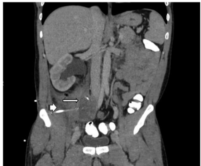
Figure 2. Computed tomography of abdomen and pelvis (coronal view) with intravenous contrast obtained 3 days after admission and initial psoas drain placement (arrow-head) shows persistent hypoattenuating mass, mildly reduced in size to 5.9 × 4.7 × 6.0 cm (arrow). The mass still compresses the right ureter, with unchanged proximal ureteral and right kidney collection system dilatation. Persistent medial deviation of the right iliac arterial vasculature and compression of the right venous iliac vasculature were noted.

Four weeks later, the patient returned to the emergency department with increasingly worse groin pain radiating down the right leg and accompanied by right inguinal edema. The patient also mentioned intermittent fevers and