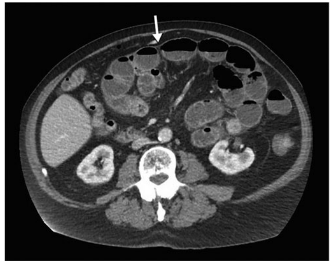
Figure 3. Computed tomography shows the small bowel abnormally localized in the upper left portion of the abdomen. An appreciable thin membrane, denoted by an arrow, surrounds the small bowel, representing the peritoneal encapsulation.

French nasogastric tube in the process. Near the terminal ileum was a clear transition point with dilated proximal bowel and normal bowel distally. On the antimesenteric side of this transition point, we discovered a Meckel diverticulum, measuring 3.1 \times 2.2 cm (Figure 2). The distal aspect of the diverticulum was tethered into the small bowel mesentery via a mesodiverticular band, potentially serving as a point of fixation leading to kinking of the bowel or preventing egress from the peritoneal encapsulation. Upon palpation, the Meckel diverticulum was noted to be abnormally thickened, possibly consistent with ectopic gastric or pancreatic mucosa in the lumen of the diverticulum. The pathology report did not mention the presence of ectopic tissue but