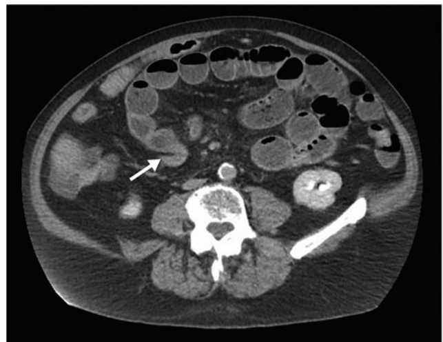
Figure 4. The distal ileum makes a sharp turn, and an appreciable transition point is at what appears to be the point of egress from the accessory peritoneal membrane. The decompressed distal bowel is indicated by an arrow.

French nasogastric tube in the process. Near the terminal ileum was a clear transition point with dilated proximal bowel and normal bowel distally. On the antimesenteric side of this transition point, we discovered a Meckel diverticulum, measuring 3.1 \times 2.2 cm (Figure 2). The distal aspect of the diverticulum was tethered into the small bowel mesentery via a mesodiverticular band, potentially serving as a point of fixation leading to kinking of the bowel or preventing egress from the peritoneal encapsulation. Upon palpation, the Meckel diverticulum was noted to be abnormally thickened, possibly consistent with ectopic gastric or pancreatic mucosa in the lumen of the diverticulum. The pathology report did not mention the presence of ectopic tissue but