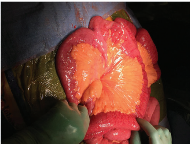
Figure 2. A Meckel diverticulum was observed in the distal ileum. The apex of the diverticulum was tethered to the small bowel mesentery by a mesodiverticular band.

Inspection of the peritoneal cavity showed no evidence of intestinal malrotation, carcinomatosis, or infection. However, a large, well-vascularized, thin, translucent membrane encased the small bowel from the ligament of Treitz to the terminal ileum (Figure 1). The membrane was incised, with a segment resected and sent to pathology despite its overall benign appearance. The bowel was then run from the ligament of Treitz distally, decompressing the bowel via an 18