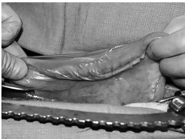
Figure 3. The ileum is wrapped in a sodium hyaluronate/carboxymethylcellulose bioresorbable membrane (Seprafil). (To see this image in color, click to https://education.ochsner.org/publishing-services/toc/bertoni-16-0076-fig3 .)

reversal 3 weeks after the index operation, while ostomies created without SH/CMC wraps ( n=54 ) were assessed after 6-12 weeks. Phase II of the trial was designed with assessment of both treatment groups for ileostomy closure 3 weeks postoperatively. The mean 4-quadrant adhesion scores, as assessed by the surgeon at the time of ileostomy closure, were significantly lower for ileostomies created with an adhesion barrier (SH/CMC). The adhesion barrier patient group also had significantly lower perioperative complications. However, Tang et al found no difference in operative time with the use of SH/CMC.