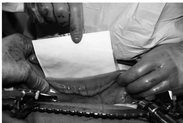
Figure 1. A sheet of sodium hyaluronate/carboxymethylcellulose bioresorbable membrane (Seprafilm) is applied to a section of ileum selected for ileostomy creation. (To see this image in color, click to https://education.ochsner.org/publishing-services/toc/bertoni-16-0076-fig1 .)

We found no difference in wound infection at the stoma site adjusted for BMI with or without the use of SH/CMC (Table 2). Group 1 had 8 infections (5.5%) vs 10 infections in Group 2 (6.8%) ( P=0.62 ). No increase in other complications including ileus, bleeding, anastomotic leak, or stoma site hernia occurred with the use of SH/CMC ( P=0.3 ).