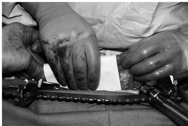
Figure 2. A sheet of sodium hyaluronate/carboxymethylcellulose bioresorbable membrane (Seprafilm) with Tevdek backing is wrapped around the piece of ileum. (To see this image in color, click to https://education.ochsner.org/publishing-services/toc/bertoni-16-0076-fig2 .)

In a 2003 study, Tang et al randomized patients into 2 treatment groups (ileostomy creation with and without placement of SH/CMC at the ileostomy site). 10 In phase I of the trial, patients with SH/CMC-wrapped ileostomies ( n=51 ) were assessed by water-soluble enema for ileostomy