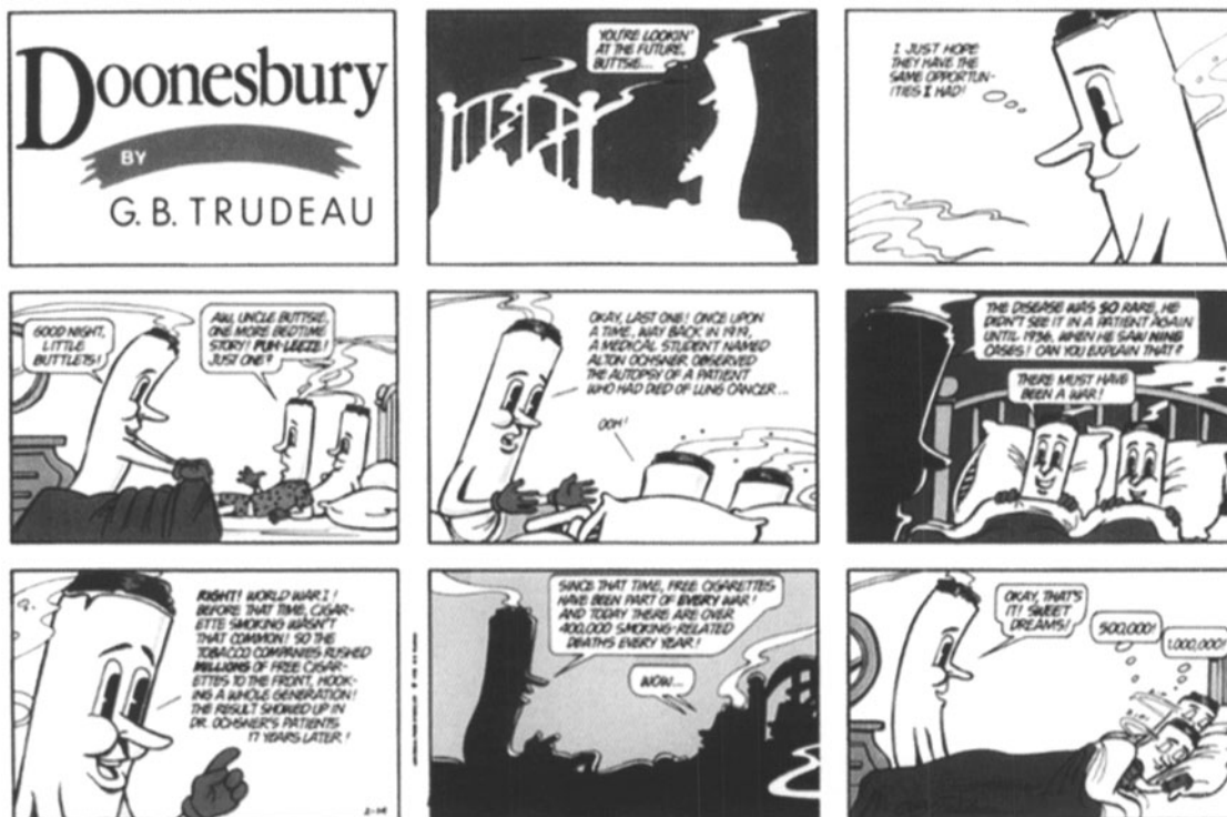
Figure 1. DOONESBURY © 1993 G. B. Trudeau. Reprinted with permission of UNIVERSAL PRESS SYNDICATE. All rights reserved.

Because of the epidemic nature that smoking now represents to us as a society, it is important that all physicians and health care providers focus on two key measures in order to reduce the morbidity and mortality associated with smoking as we enter the next century: 1) to assess and document smoking status in all patients under the care of the physician; 2) to learn and use a brief intervention message to help patients quit.