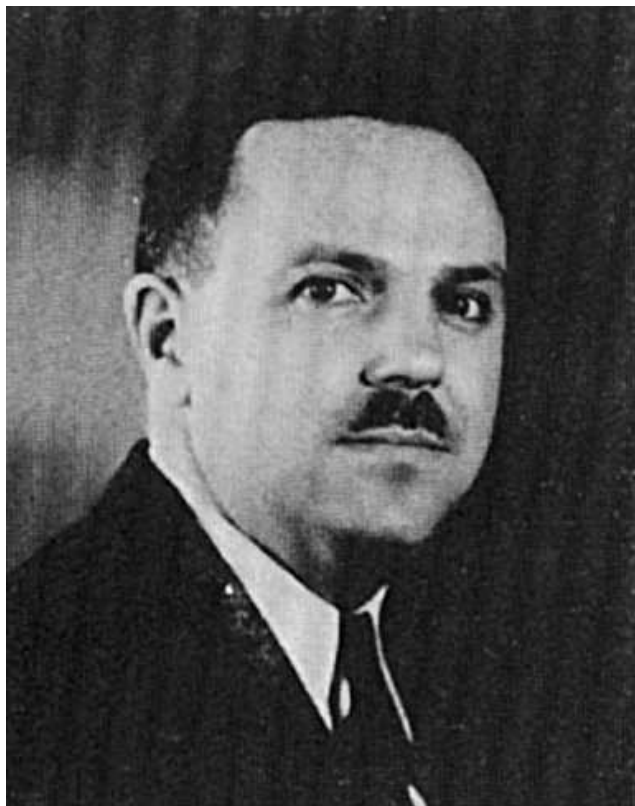
Figure 1. Alton Ochsner, circa 1935.