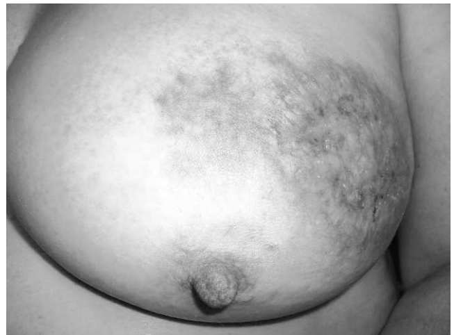
Figure 4. Posttreatment: left breast pyoderma gangrenosum.

The most common anatomical site for PG in patients with inflammatory bowel disease (IBD) is the lower limbs, where it has been reported in 75%-80% of IBD patients. 1,8-10 PG was originally thought to be pathognomonic of IBD, affecting UC patients more than those with Crohn disease. 2,11-14 Although this