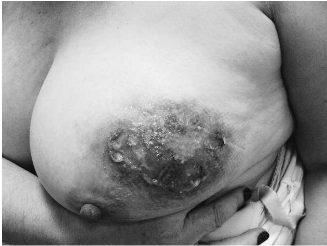
Figure 1. Pretreatment: left breast pyoderma gangrenosum.

most recent ESR was 18 mm/hr. She is still being seen for regular follow-up, and the oral steroid dose is monitored according to the clinical response.