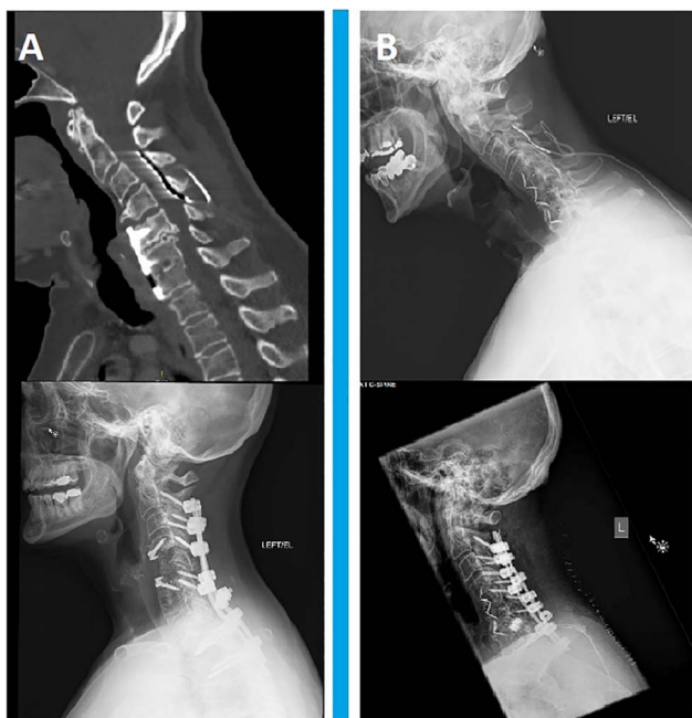
Figure 2. Illustrative cases of spinal instability after paddle lead placement in patients with prior cervical fusion. A. Sagittal computed tomography scan (bone window) of the cervical spine shows loss of alignment above the fused levels (top image). The patient presented with progressive myelopathy secondary to worsening cord compression 6 months after paddle lead placement. Lateral cervical x-ray shows posterior fusion surgery required for the case (bottom image). B. Lateral x-ray of the cervical spine shows loss of alignment above the fused levels (top image). The patient presented 9 months after paddle lead placement with worsening neck pain and myelopathy secondary to instability. Lateral cervical x-ray shows posterior fusion surgery required for the case (bottom image).

Although cervical laminoplasty has been associated with prolonged neck pain, loss of range of motion, and worsening cervical kyphosis, 18 preserving the supraspinous and interspinous ligaments at the distal ends of the laminoplasty may provide more stability than laminectomy. 16 The two laminoplasty techniques described provide a means to stabilize the lead paddle in the epidural space. 13 In addition, preservation of the lamina has been shown to reduce scar tissue formation. 19 Scar tissue following laminotomy for SCS implantation is associated with loss of stimulation effect caused by early migration, 6,20 and more rarely, development of myelopathy. 21