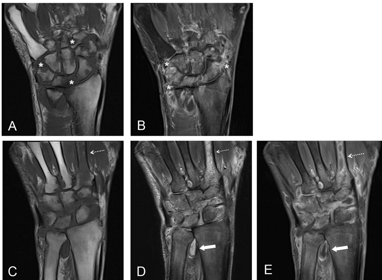
Figure 2. Most recent magnetic resonance imaging examination at the carpal level with (A) coronal T1 and (B) coronal postcontrast T1 fat saturation sequences with inclusion of the metacarpals on (C) coronal T1, (D) coronal short T1 inversion recovery (STIR), and (E) coronal post-contrast T1 fat saturation sequences. Views A and B show joint space narrowing, osseous erosions (asterisks), and synovial enhancement (asterisks) throughout the carpals. Dashed white arrows show marrow edema (views C and D) and enhancement (view E) of the second metacarpal concerning for osseous involvement of the adjacent infectious process within the carpals. Additionally, complex enhancing fluid is seen at the distal radioulnar joint (solid arrows in views D and E).

pyogenic and fungal infections, giant cell tumor of tendon sheath, pigmented villonodular synovitis, and rheumatoid arthritis, particularly given the presence of marginal osseous erosions, rice bodies, and synovial thickening and enhancement on MRI. 8 Even at surgery, profuse and proliferative tenosynovium is commonly found and likened to rheumatoid pannus. 9 The slow progression of joint space narrowing may help differentiate mycobacterial infection from rheumatoid arthritis and pyogenic infection, both of which demonstrate a more rapid and early course of joint space narrowing; however, the gold standard for mycobacterial infection diagnosis is tissue biopsy and synovial cultures. 1,2,6,8