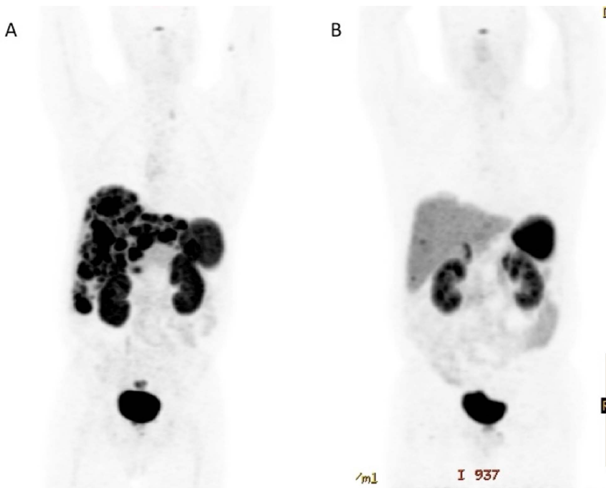
Figure 3. (A) Pretreatment gallium-68 dotatate positron emission tomography (PET) scan demonstrates burden of hepatic metastatic disease, with primary rectal tumor obscured by tracer in the urinary bladder. (B) Gallium-68 dotatate PET scan obtained 8 weeks after completion of PRRT demonstrates near-resolution of abnormal tracer uptake.

8.4 months in the high-dose octreotide group (hazard ratio 0.21, 95% CI 0.13-0.33; P < 0.0001 ). Responses occurred in 18% of patients, with the majority of patients having stable disease.