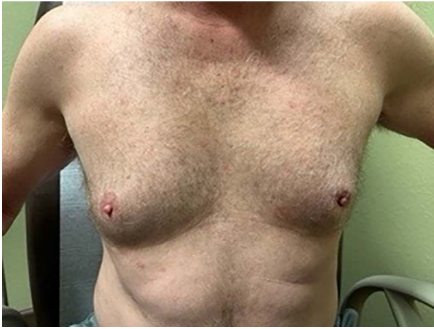
Figure 1. At the patient's initial clinic visit, the mass was palpable in the left breast under the nipple-areolar complex.

(Figure 1) and an associated 3-cm palpable lymph node in the level II region of the left axilla. There was no associated nipple discharge.