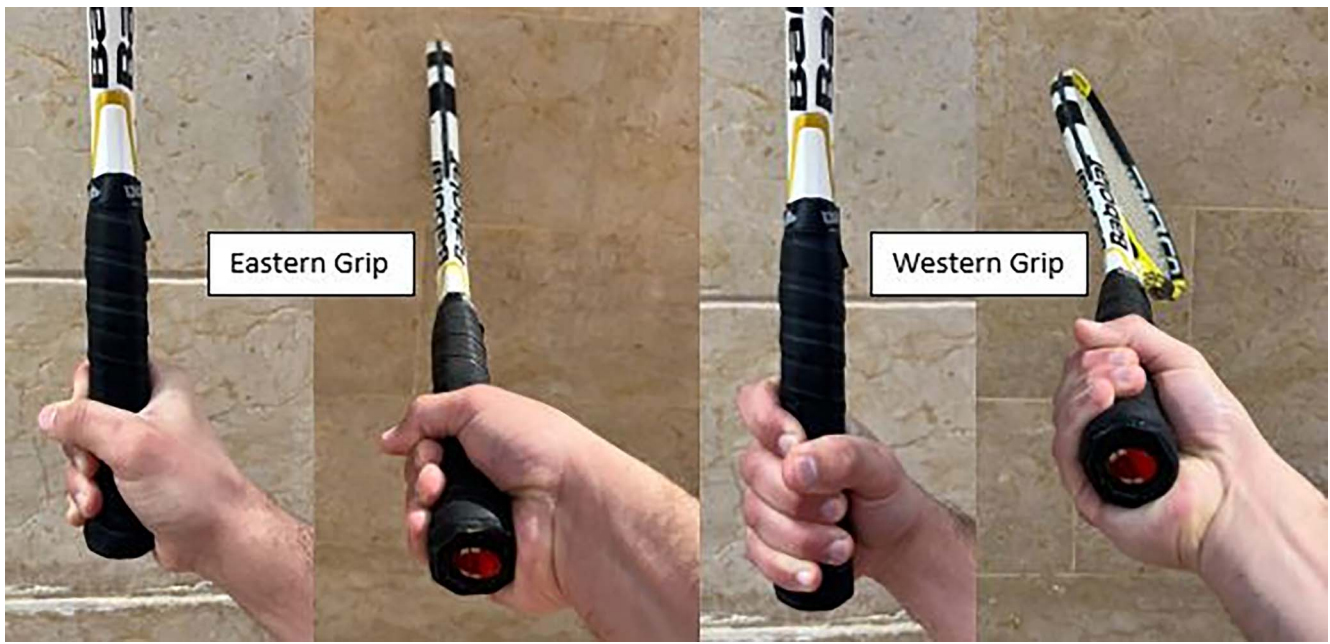
Figure 1. Eastern and western grip techniques.

On physical examination, the patient had point tenderness over the dorsal aspect of the wrist proximal to the level of the base of the second metacarpal. He complained of pain only during extension of the index finger. Otherwise, he had full nonpainful active range of motion (ROM) of the wrist and fingers and had no swelling, masses, or deformities. Radiographs of the right wrist were normal (Figure 3). Tendonitis of the extensor tendons was suspected, and the patient was