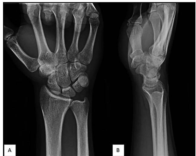
Figure 3. Unremarkable (A) posteroanterior and (B) lateral radiographs of the right wrist show no evidence of acute fracture.